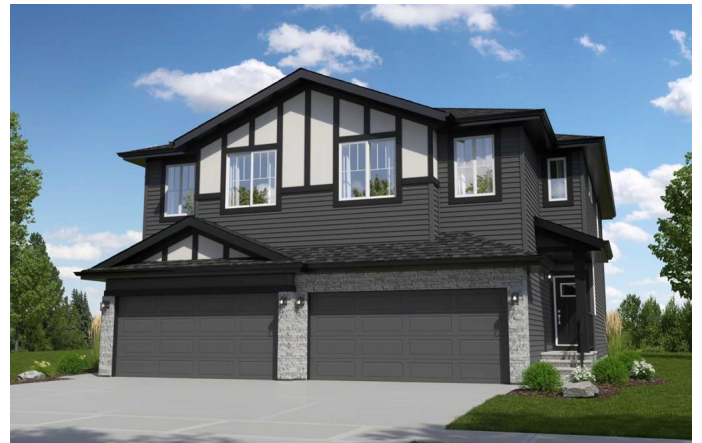
SOUD 001.029 BREEZE

Welcome to 140 Southbow Village Way in Cochrane, a beautifully designed half-duplex with a double-attached garage, a side entrance, and zoning for a legal suite, all with no condo fees, making this an incredible investment in both lifestyle and future potential. Built by Daytona Homes, this thoughtfully crafted home offers modern design, smart functionality, and quality craftsmanship in a sought-after community. Stepping inside, youâ€™re greeted by a spacious mudroom on the left complete with a large closet for easy storage and organization. This area is joined by a convenient two-piece bathroom, perfect for guests. Moving toward the back of the home, a bright, open staircase leads upstairs, creating an inviting flow through the main level. The heart of the home features a spacious kitchen with a central island seamlessly connecting to the great room and eating nook, making it the perfect space for entertaining or everyday family life. Upstairs, the layout continues to impress with a dedicated laundry area in the hall, adding convenience to daily routines. At the rear of the home, two well-sized bedrooms share a three-piece bathroom, providing comfort and privacy for family members or guests. Separating the bedrooms from the primary suite, a large bonus room offers flexibility as a media space, playroom, or home office. At the front of the home, the primary suite is a true retreat, featuring a luxurious five-piece ensuite with dual sinks, a soaker tub, a separate